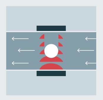
Amplitude monitoring for bubble detection