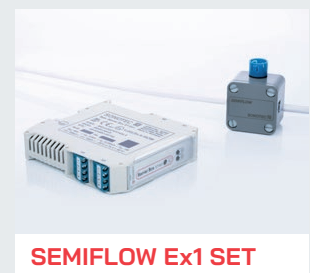
SEMIFLOW Ex1 SET