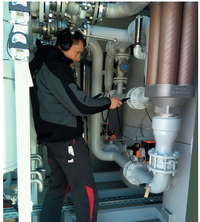
Leak test by apikal Anlagenbau GmbH after completion of the installation work on a compressed air container station

In the future, apikal will consider using SONAPHONE® for other application areas.