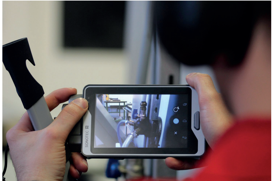
Images of the leak can be taken with the integrated camera