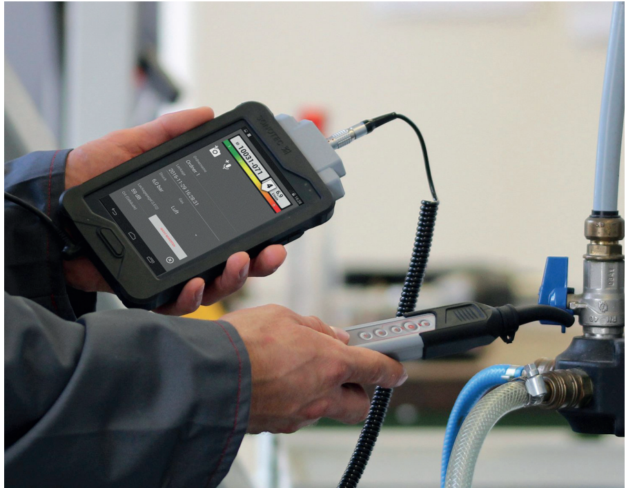
In the vicinity of the leak, the more precise sensor attachment provides information about the exact location and the amount of compressed air flowing out.

For this purpose, the precise attachment is placed on the airborne sound sensor. The service technician looks for the maximum sound level and then triggers the automatic leak assessment with the